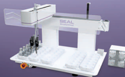
SEAL Minilab 1200

SEAL Robotic Minilab systems for automating sample (pre) treatment in the laboratory — improving your sample handling efficiency. Typical applications include BOD, pH, COD, Alkalinity, and conductivity measurements with options such as decapping/capping, sample splitting, and filtration. Call us about your laboratory needs and we will design a robot to suit you.