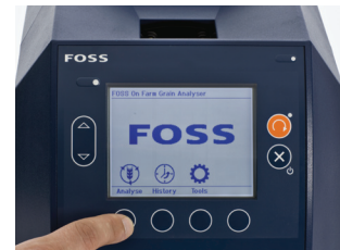
2. Select grain type