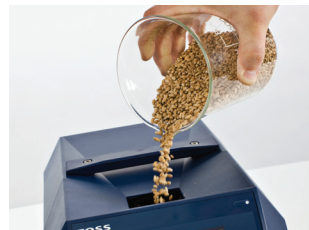
1. Pour in the sample