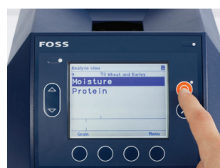
3. Press start