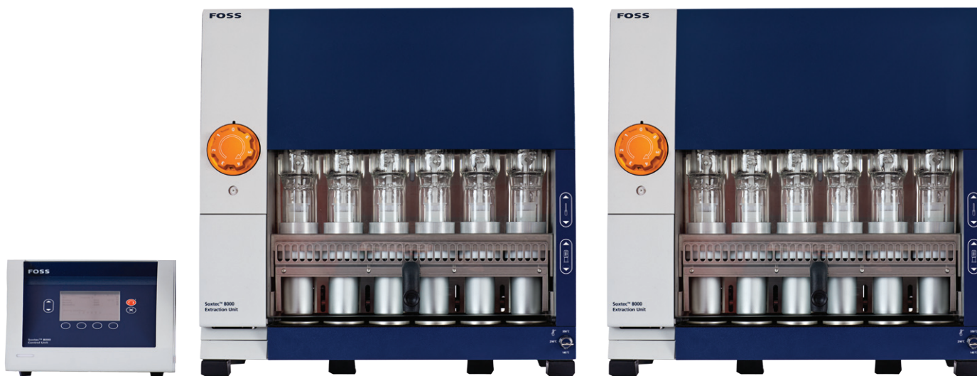
The six position extraction unit can be expanded to 12.